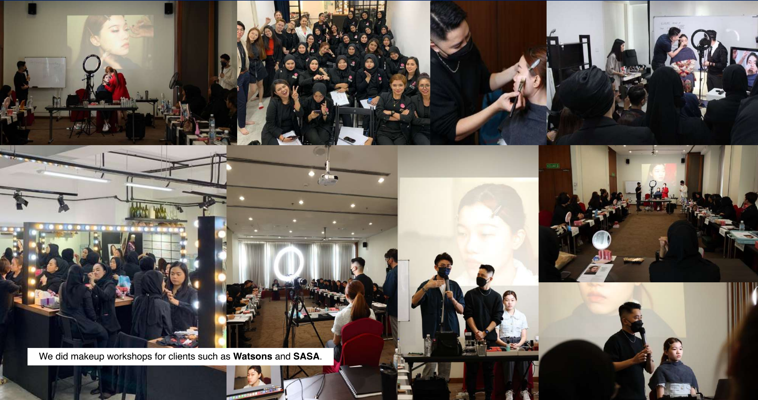
We did makeup workshops for clients such as Watsons and SASA .